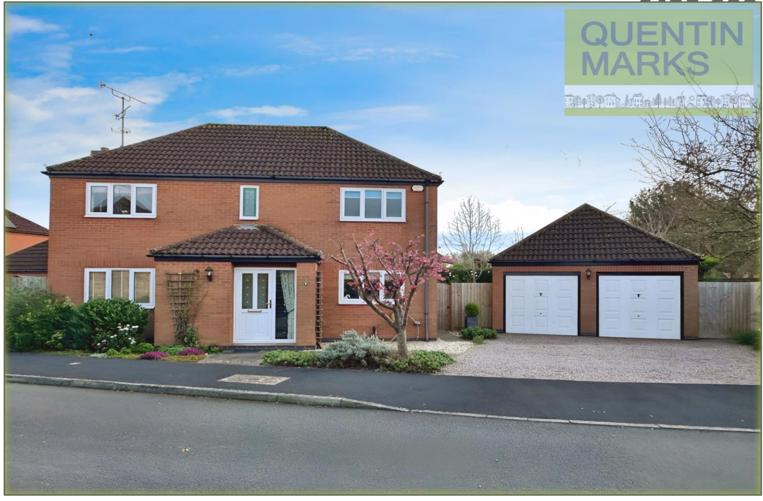
Detached Family Home Immaculately Presented Versatile Accommodation